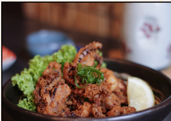
TAKO KARAAGE 9.5 Fried Octopus