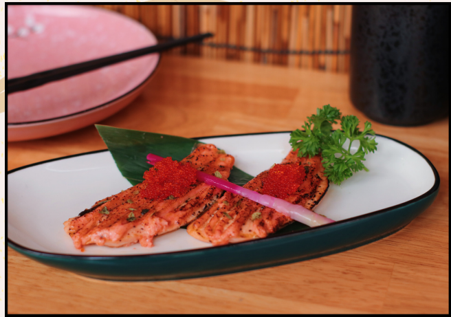
SAKE MENTAI 13.8 Salmon in mentai dressing