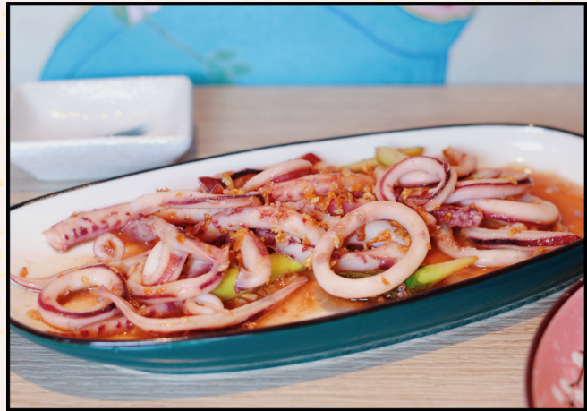
SURUMEIKA TEPPANYAKI 17.8 Cuttlefish in garlic butter sauce