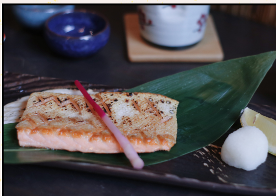
SAKE BARA SHIOYAKI