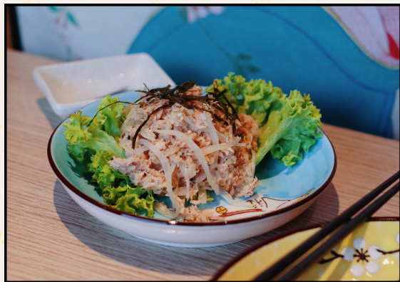
TUNA NEGI SALAD Tuna Chunks with Onion Salad