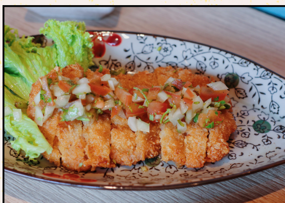
CHICKEN KATSU WITH SALSA 9.5 Deep-fried Chicken Cutlet with Salsa Dressing