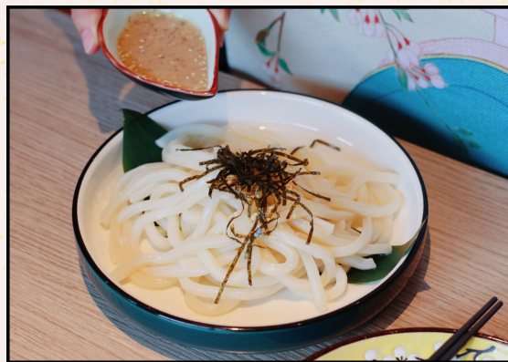
GOMA COLD UDON ✓ 8.8 Cold Udon with Sesame Dipping Sauce