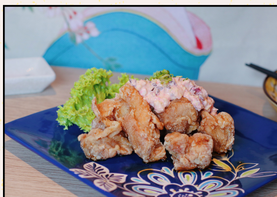
TORI NAMBAN KARAAGE 10.8 Deep-fried Chicken with Namban Vinegar and Tartare Sauce