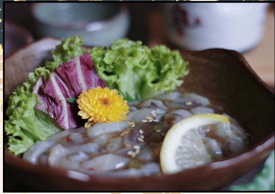
TAKO WASABI Squid in wasabi marinade