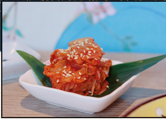
KIMCHI ✓ Korean Picked Vegetable