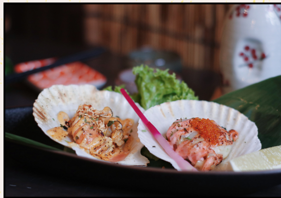
HOTATE MENTAI & NINIKU 11.8 Grilled Scallop with garlic dressing