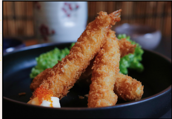
EBI FURAI 9.5 Fried Breaded Prawns