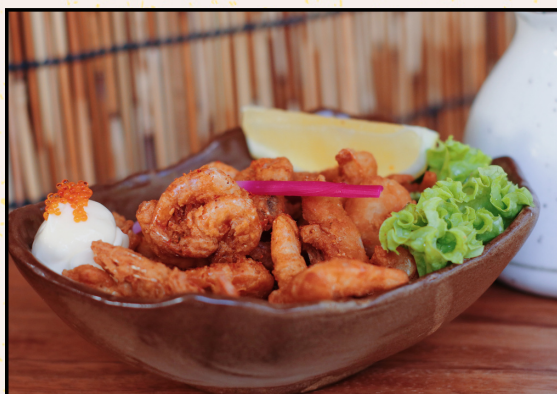
AMAEBI 9.5 Deep-fried Baby Shrimps