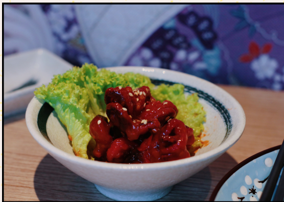
CHUKA IDAKO Seasoned Baby Octopus