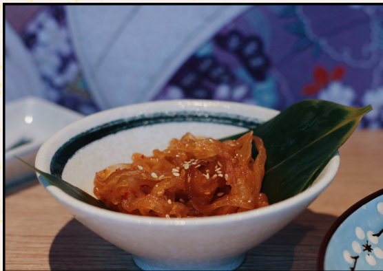
CHUKA KURAAGE Seasoned Jellyfish