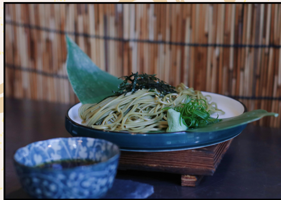
CHA SOBA ✓ 8.8 cold Buckwheat Noodles