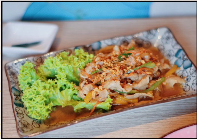
BUTA BARA SHIOGAYAKI 12.8 Pork Belly Stir-fried in Ginger Sauce