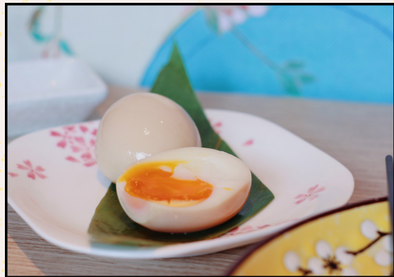
AJITSUKE TAMAGO Seasoned Egg