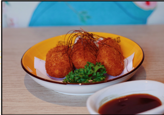
KOROKKE 9.5 Coroquette in Special Sauce