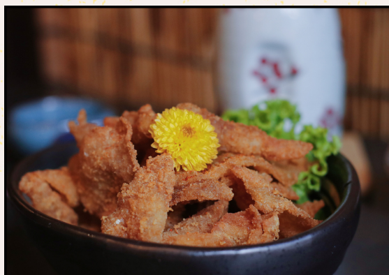
KAWA KARAAGE 7.5 Deep-fried Chicken Skin