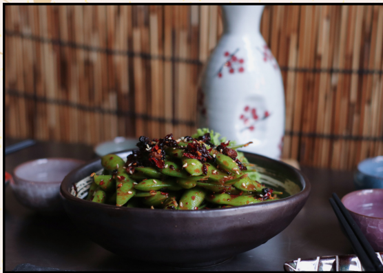
EDAMAME/SPICY EDAMAME ✓ 6/8 Japanese Bean / Spicy with Lau Gan Ma