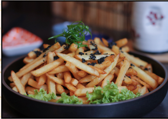
TRUFFLE FRIES ✓ Fries in Truffle Oil