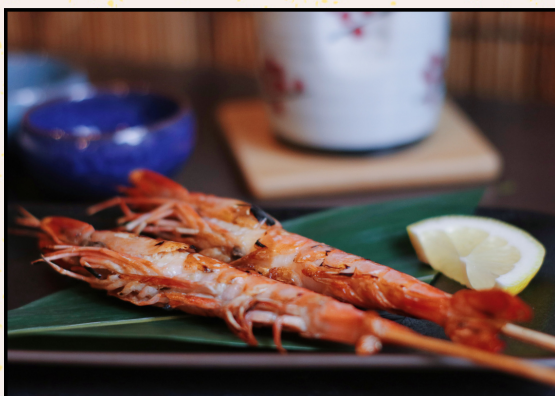
EBI SHIOYAKI 6.8 Prawns seasoned with Salt (2 pcs)