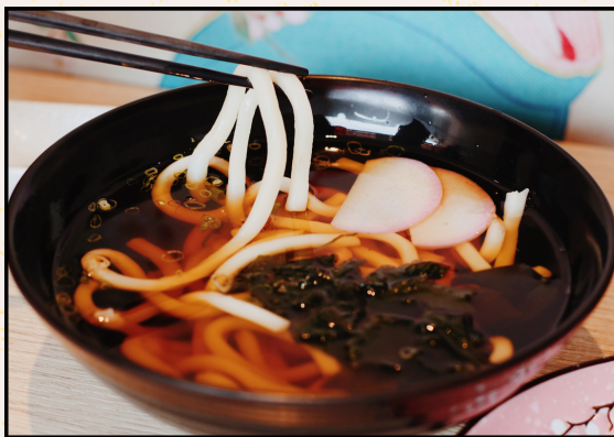
HOT UDON/SOBA 8.8 Udon/Soba in Dashi Soup