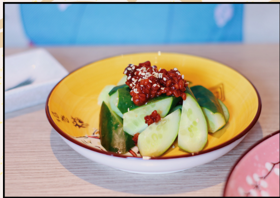
MORO KYUURI ✓ Cucumber with Japanese Miso