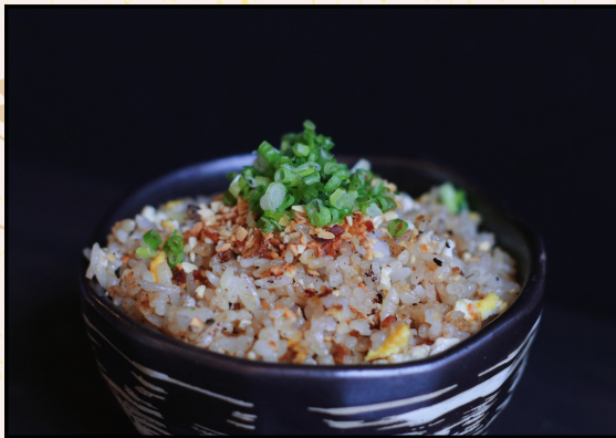
GARLIC YAKI MESHİ 6.8 Garlic Fried Rice