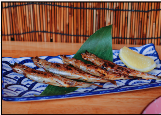
SHISHAMO 8.8 Grilled Hokkaido Fish (4 pcs)