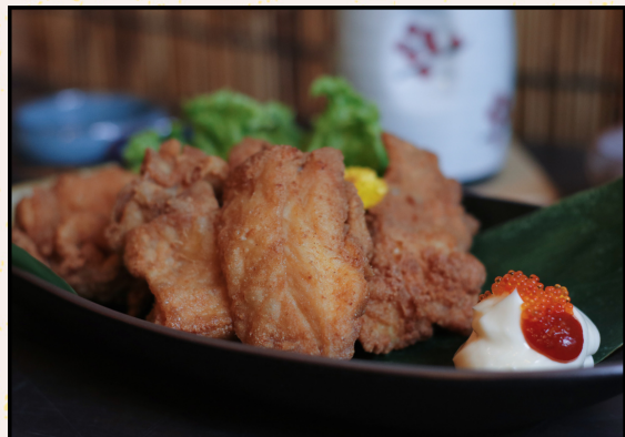
TORI KARAAGE 9.5 Fried Chicken