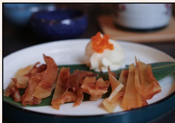
EHIRE 11.8 Stingray