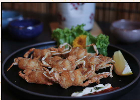
CHISANA KANI 9.5 Deep-fried Baby Crabs