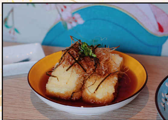
AGEDASHI TOFU 7.5 Deep-fried Bean Curd