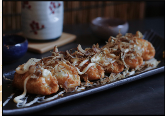
GYOZA MAYO KARAAGE 7.5 Fried Dumplings in Mayo