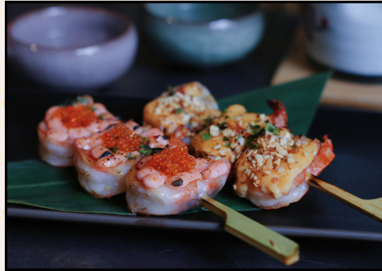
EBI MENTAI & NINIKU 15.8 Prawns with Mentaiko & Garlic Dressing